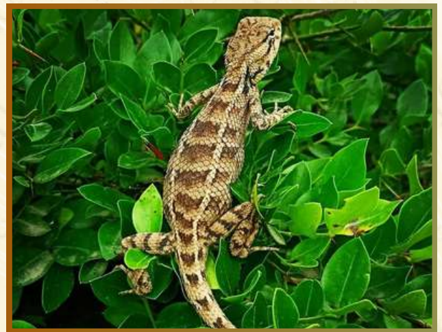
PHOTOGRAPHER MEGHA SHARMA, B.COM 1ST YEAR

"The image presents a striking Oriental garden lizard, poised elegantly amid a lush, green backdrop. The lizard's detailed scales exhibit a blend of earthy colors that contrast beautifully with the vibrant green leaves surrounding it. Its alert eyes and slender physique are highlighted, showcasing the adaptability and alertness characteristic of this species. This lizard is often admired for its ability to change color and texture, adapting seamlessly to its environment, making it a fascinating subject for nature photography."