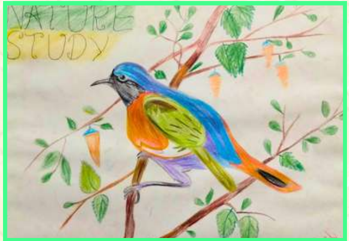
ARTIST SUPRIYA MALLICK, B.S.C 1st Year

The painting depicts a vibrant bird perched gracefully on a slender tree branch, surrounded by lush green leaves. The bird, with its striking plumage in shades of blue, yellow, and hints of orange, stands out against the deep greens of the foliage. Its delicate features are accentuated by a soft, warm light, highlighting the texture of its feathers. The tree branch is gnarled and textured, suggesting age and strength, while the background hints at a serene landscape, perhaps a softly blurred sky or distant hills. The overall composition evokes a sense of peace and connection to nature, inviting viewers to appreciate the beauty and tranquility of the moment..